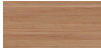
● W34 Blackbutt

We are always developing and adding to our range, please contact your Autex Acoustics representative to discuss Acoustic Timber options tailored for your project.