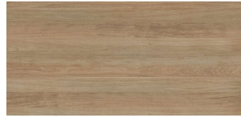
● W32 Aged Oak