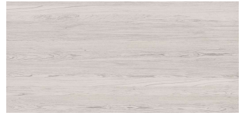
● W31 Whitewash Gum