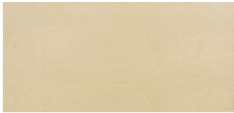
● W1 Birch