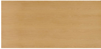
● W3 Oak