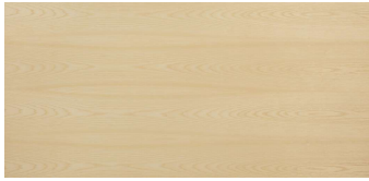
● W4 American Ash