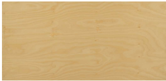
● W2 Hoop Pine