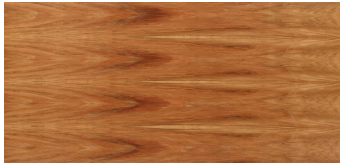
● W5 Tasmanian Blackwood