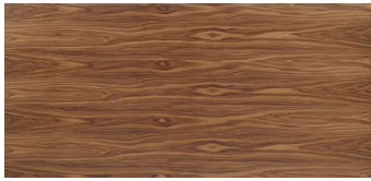
● W7 Queensland Walnut