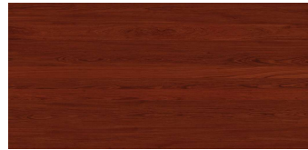
● W20 Jarrah