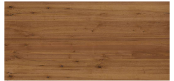
● W21 Black Walnut