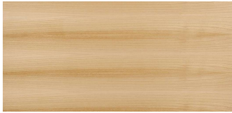
● W6 Eucalyptus