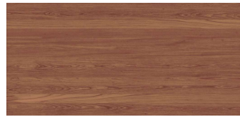
● W18 Grey Ironbark