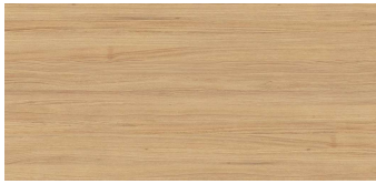
● W12 Tasmanian Oak