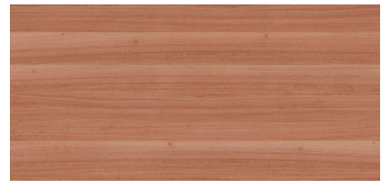
● W19 Blue Gum