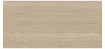
● W33 Nordic Oak